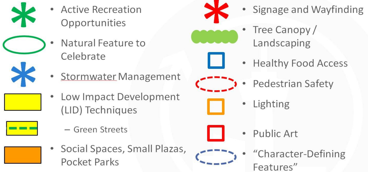
Figure 1. Infrastructure and Amenities Legend