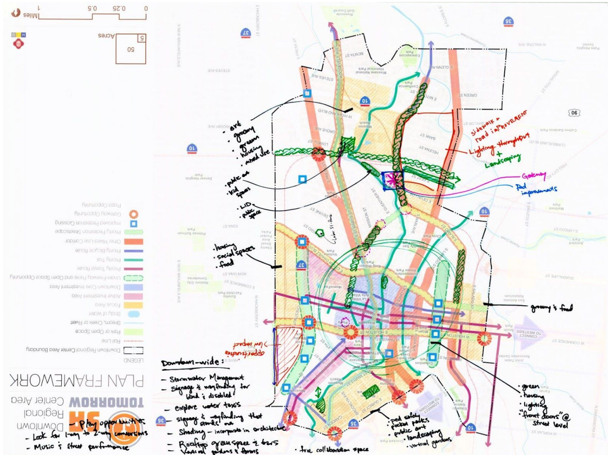
Figure 2. Infrastructure and Amenities Breakout Group Results